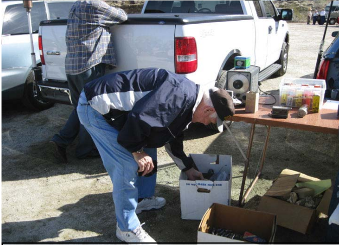
Ah...there's gotta be something cool in here!