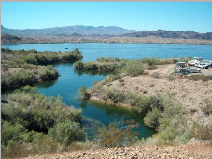
View from Partner's Point

For more details, see Dick Jernigan, W7DXJ.