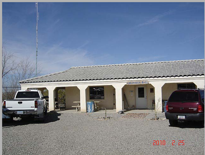
Partner's Point: Volunteer Hall