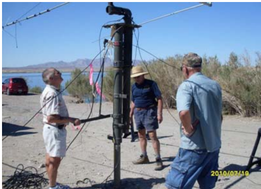
Let's see. If I pump this, it'll go up?