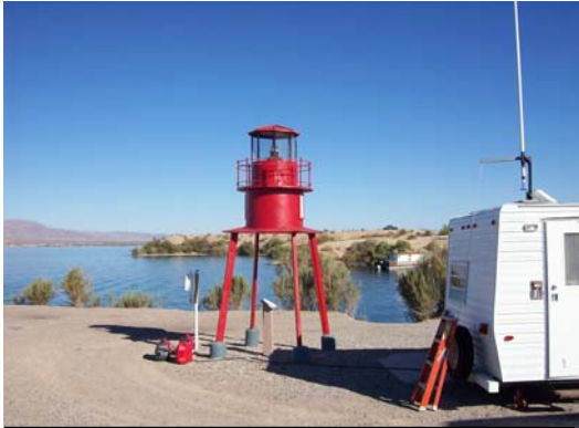
Replica of the Alpena, MI lighthouse

The Lighthouse Club is a nonprofit group of independent Lake Havasu City citizens, dedicated to the preservation, improvement and promotion of Lake Havasu and the Lake Havasu City lifestyle. Their mission is to provide aids to navigation on the lake, in the form of miniature lighthouses. The lights would be replicas of famous lighthouses around the country. They would enhance safety for boaters and provide an additional attraction for visitors to the lake.