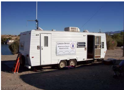
Another shakedown cruise for the Club's Emergency trailer.