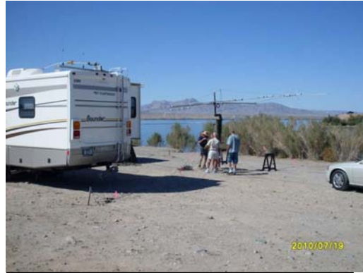
This ground is hard as rocks.....oh that's right! It is rock!