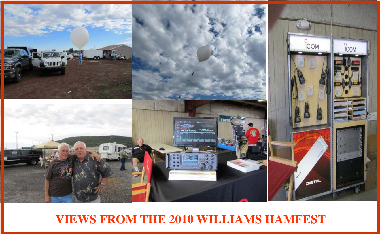
VIEWS FROM THE 2010 WILLIAMS HAMFEST